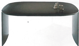
LAURAMERONI DESIGN BARTOLI DESIGN POE, TAVOLO CON GAMBE IN LEGNO RIVESTITE CON INTARSO DI PAGLIA DI SEGALE COLORE GRIGIO E PIANO LACCATO LUCIDO GRIGIO. TABLE WITH WOODEN LEGS COVERED WITH GRAY INLAIN EYE STRAW, TOP IN SHADED GLOSSY PAINT LACQUER. laurameroni.com