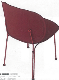
SANCAL DESIGN DESIGN YONORI MULTIPLI, SEDIA CON STRUTTURA IN METALLO VERNICIATO, SEDUTA E SCHIENALE IMBOTTITI A FORMA DI CUSCINO. CHAIR WITH STRUCTURE IN PAINTED METAL, PADDED SEAT AND BACK WITH CUSHION FORM sancal.com