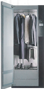
V ZUG DESIGN UFFICIO TECNICO REFRESH- BUTLER, ARMADIO FINITURA CROMO, CON SISTEMA INCORPORATO PER LA CURA DEI VESTITI, CON PROGRAMMI TECNOLOGICI DI ASCIUGATURA, IGIENIZZANTE ANTIBATTERICO, RINFRESCANTE. CHROME-FINISH WARDROBE WITH BUILT-IN GARMENT CARE SYSTEM AND TECHNOLOGICAL DYEING, ANTIBACTERIAL AND REFRESH PROGRAMS zug.com